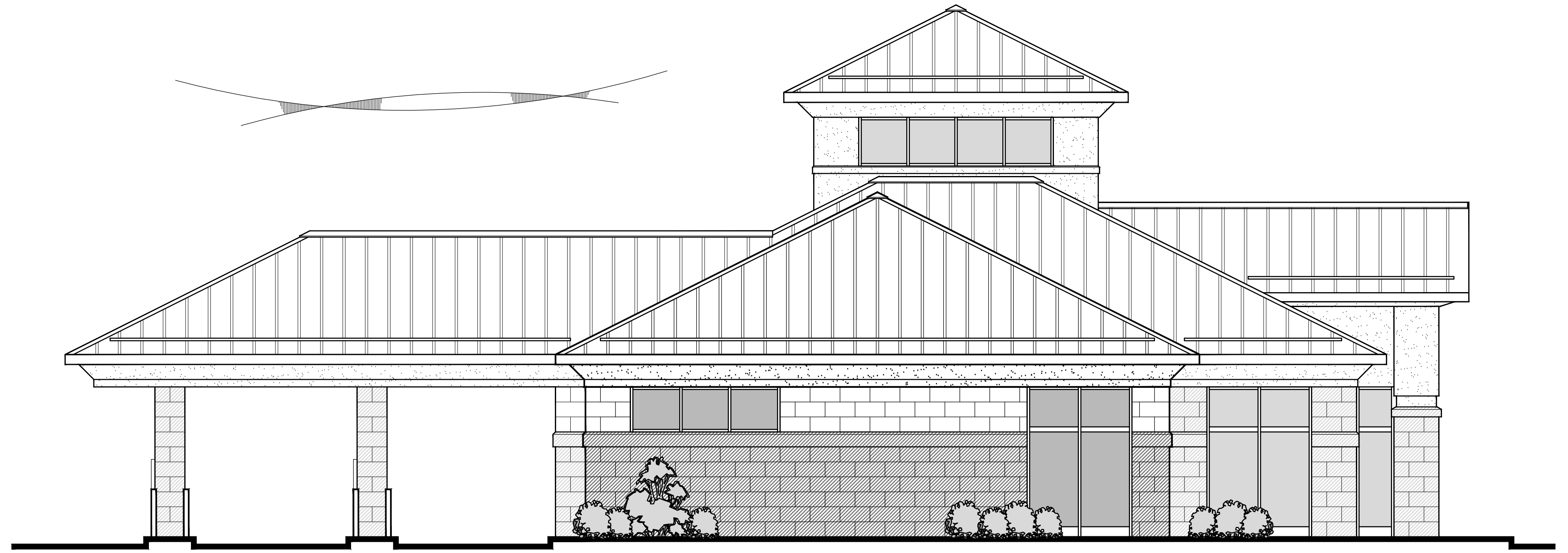
2 3 PRELIMINARY SOUTH ELEVATION SCALE: 3/16" = 1'-0" 0' 2' 5' 10'

Hudson Valley FEDERAL CREDIT UNION 87 BROOKSIDE AVE. CHESTER, NEW YORK PROPOSED NEW CHESTER BRANCH