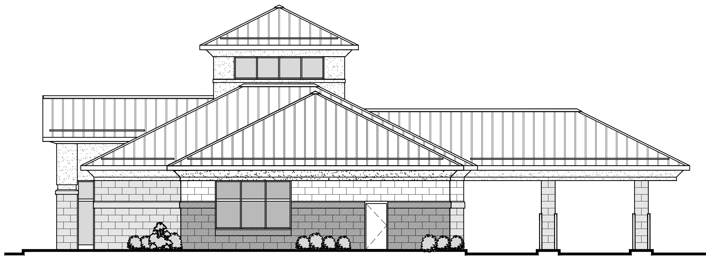
4 3 PRELIMINARY NORTH ELEVATION SCALE: 1/8" = 1'-0" 0' 5' 10' 20'