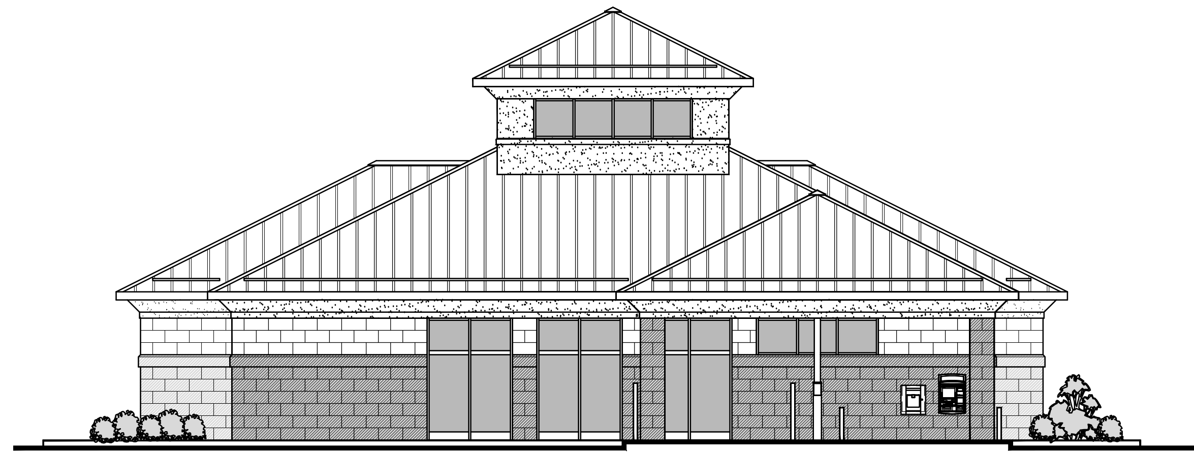
3 3 PRELIMINARY WEST ELEVATION SCALE: 1/8" = 1'-0" 0' 5' 10' 20'