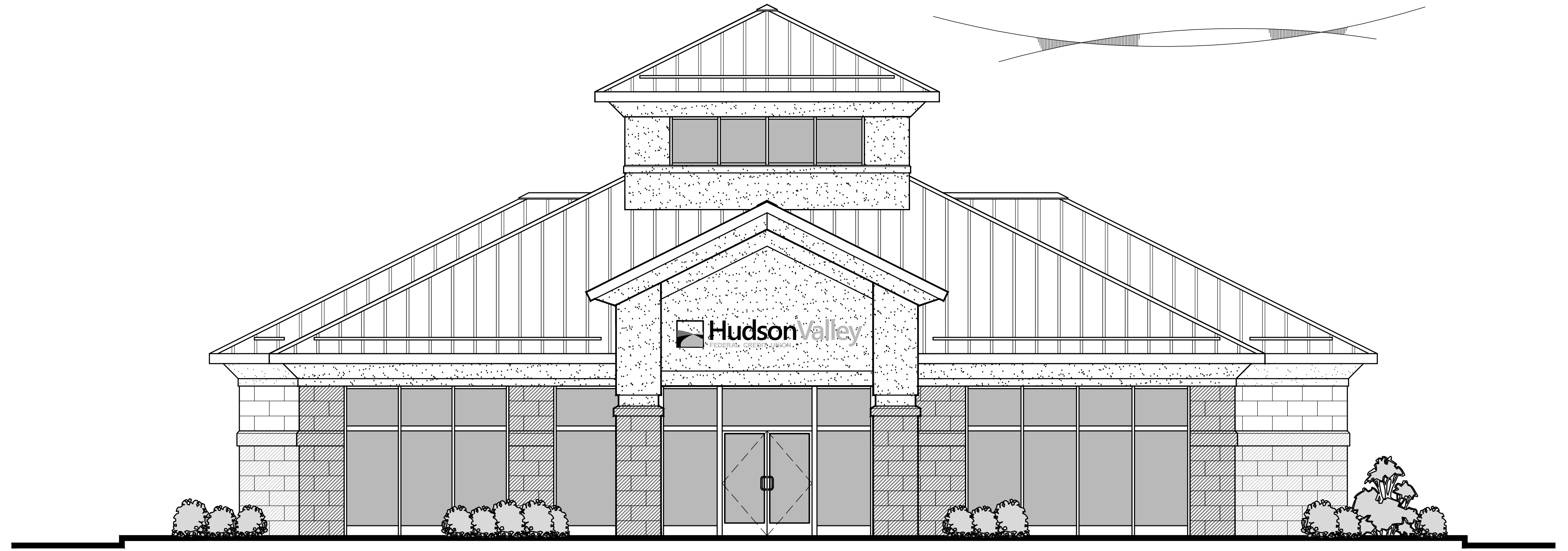
1 3 PRELIMINARY EAST ELEVATION SCALE: 3/16" = 1'-0" 0' 2' 5' 10'