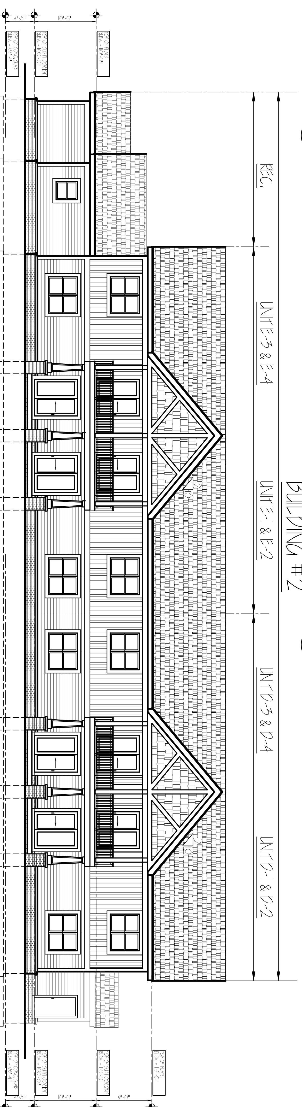
4 REAR ELEVATION BUILDING #2 A-5 SCALE 1/8" = 1'-0"

PRELIMINARY - OCTOBER 29, 2019 PRELIMINARY - NOVEMBER 25, 2019